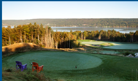
The Lakes Golf Course - Ben Eoin

The game of golf is about places — the challenge, beauty and prestige of the course. There are approximately 35 thousand golf courses in the world, but only a selection of these embrace the true spirit of the game. Cape Breton is one of those places with 3 courses in Golf Digest's World 100 Greatest Courses.