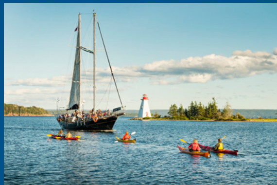
Baddeck Bay, Bras d'Or Lake

Pleasant Bay Cape Breton Highlands National Park