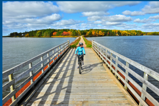
Celtic Shores Coastal Trail