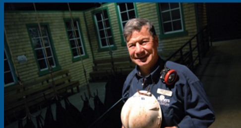
Miners Museum - Glace Bay

Delve into the mind of a genius at the Alexander Graham Bell National Historic Site to see how the inventor helped shape the modern world, from communication to flight to artificial respiration. Explore one of our many other museums and heritage sites.