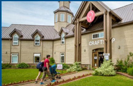
Colaisde na Gàidhlig | The Gaelic College - St. Ann's